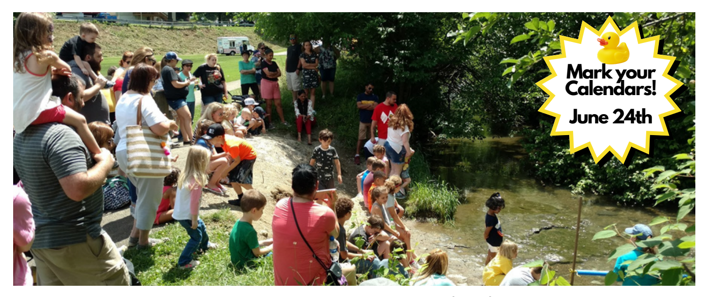
Annual Rubber Duck Race. Former racers gather to see whose duck will finish first. This year's race will be held during the Nature Festival at Irwin park on June 24, 2023 from 1 to 4 p.m. (More details on page 2.)