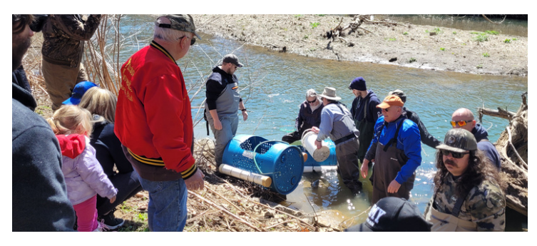
Trout stocking of Turtle Creek at Saunders Station, March 30.

The season's first trout stocking of Turtle Creek at Saunders Station is a welcome sight for fishermen. It's also a sign of victory. Because abandoned mine drainage (AMD) can still leach metals at levels toxic to fish, the water must be tested each year before stocking can be approved. Addressing AMD in the watershed is one of TCWA's priorities.