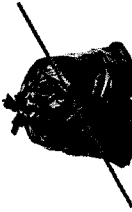
NO BAGGED RECYCLABLES