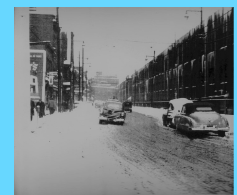
Check out the icicles on the Westinghouse building on Braddock Ave.