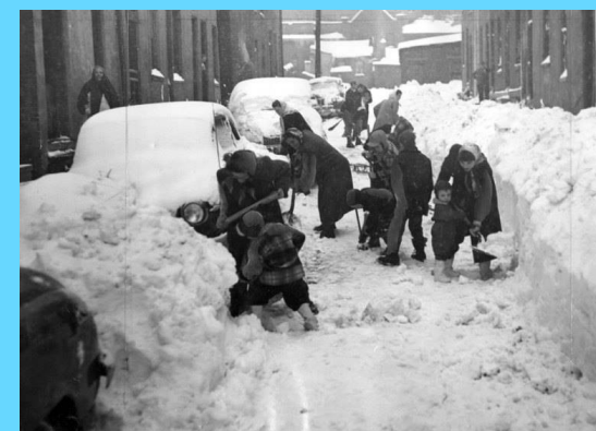
The Great Appalachian Snow Storm 1950. Thirty-one inches of snow fell on South Western PA