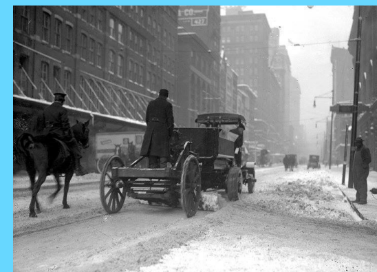
This is how they plowed snow in the early 1900s!