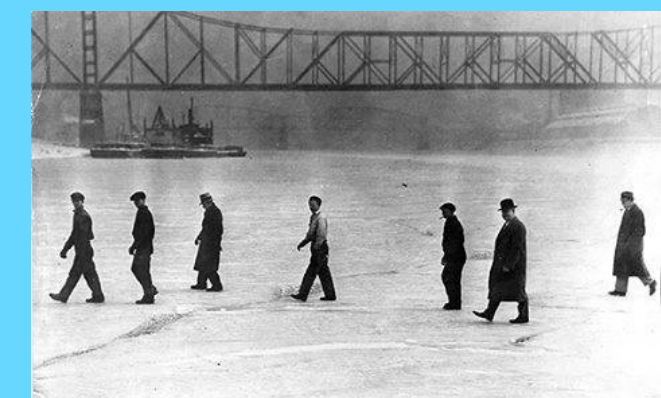
In 1936 the rivers froze 2 to 3 feet deep. Yes, people walked on them!

Thanks to "Turtle Creek Valley Historical Society"