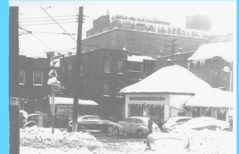
Thanksgiving Day in 1950. Direan's garage at the end of Brown Ave and Penn Ave extension.