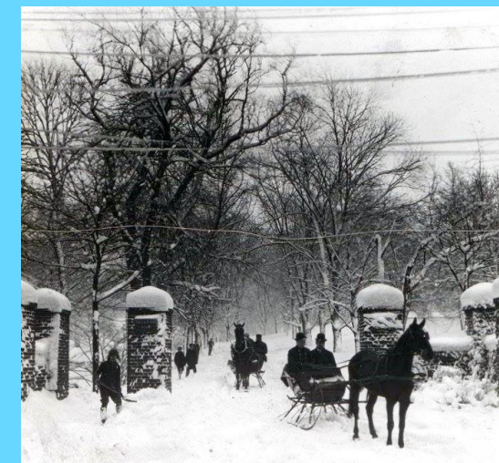
Winter Wonderland— 1905